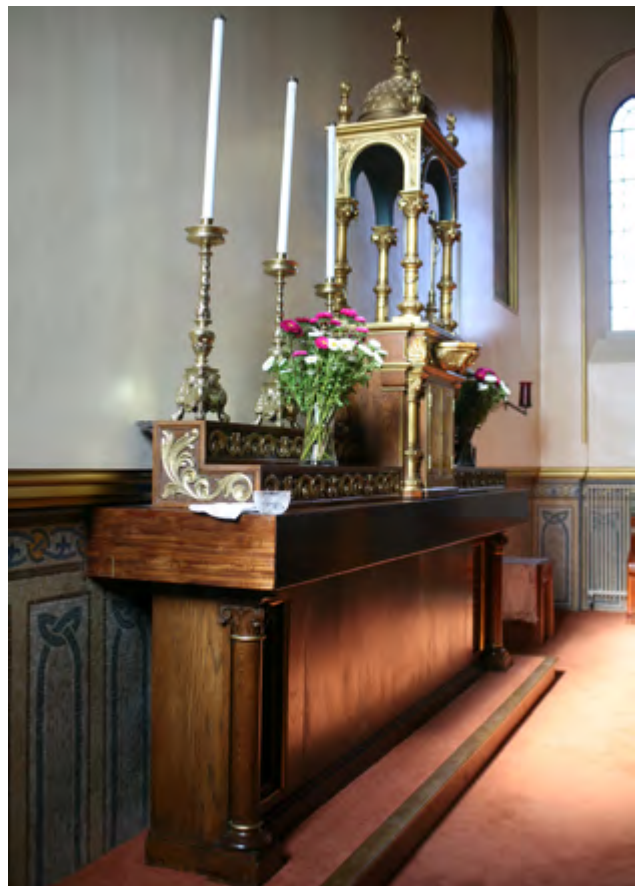
Re-ordering need not entail loss of special character