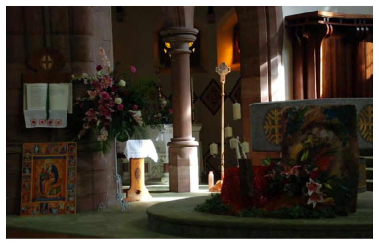
Places of worship are much more than just their architecture

However, there is also a need to manage these changes, ensuring that the special values of listed places of worship are sustained and enhanced for this and future generations. The review has concluded that, for listed places of worship, control and advice through the Listed Building Consent process, as required for all other listed buildings, is the most appropriate way to do this.