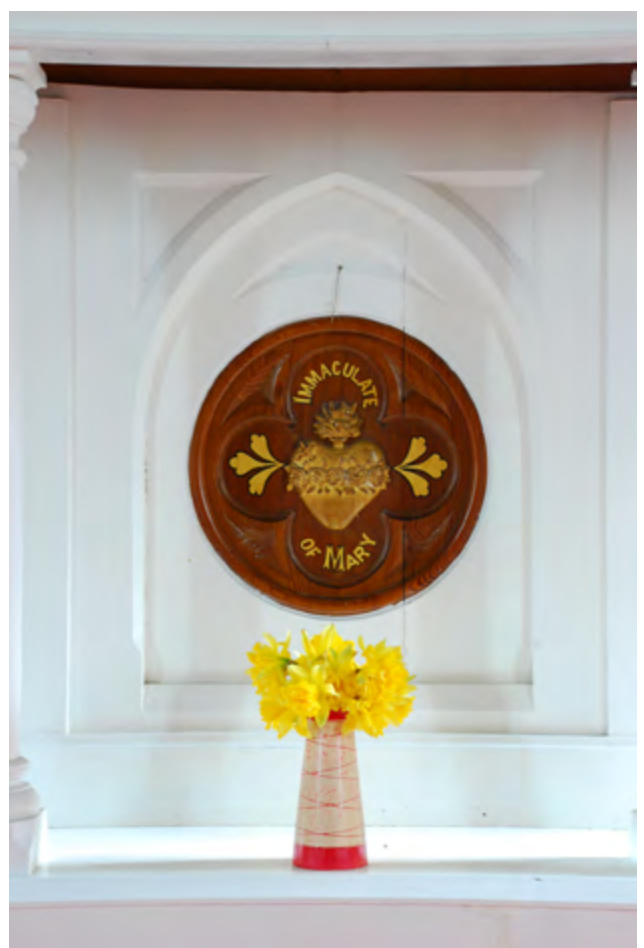
Interior features, such as these, are particularly vulnerable