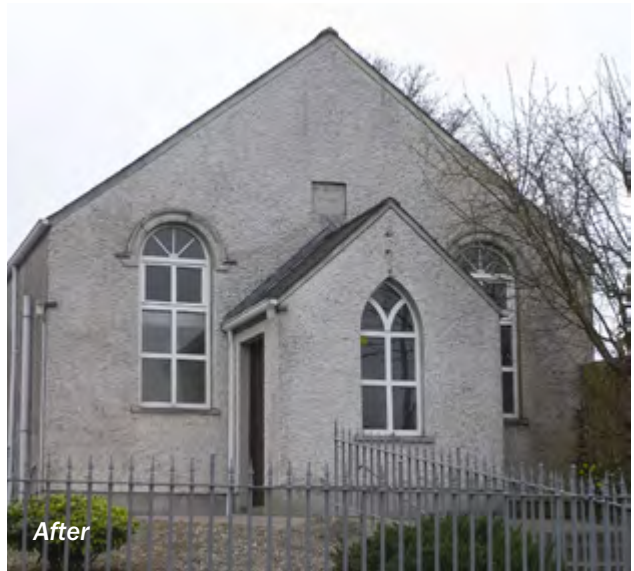
This listed chapel, built in 1818, was originally a building of significant local interest. Substantially rebuilt in 1982, it now has uPVC windows, fibre cement slates, pebble dash render and an entirely modern interior. The building no longer meets the test, and was delisted in 2010.