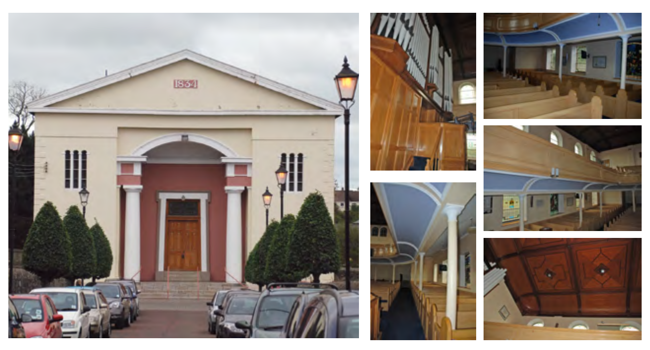
First Antrim Presbyterian Church – should the works go ahead as proposed, this magnificent interior will be lost

• Faith communities throughout Northern Ireland are changing. The last five years have seen some congregations experiencing unprecedented growth. With that growth commonly come proposals for substantial meeting/greeting spaces, extensions and internal reorganisation. Some of these schemes involve such radical alteration, very little of special interest would survive if they were to go ahead. First Antrim Presbyterian Church is one such example, where planning permission was granted in 2014 for the demolition of all historic fabric except the front façade. It was argued on behalf of the congregation that the works were exempt because worship would continue in a room behind the front wall - until the replacement church was built to the rear. Should the scheme proceed, the majority of this grade B+ listed building will be irreplaceably lost.