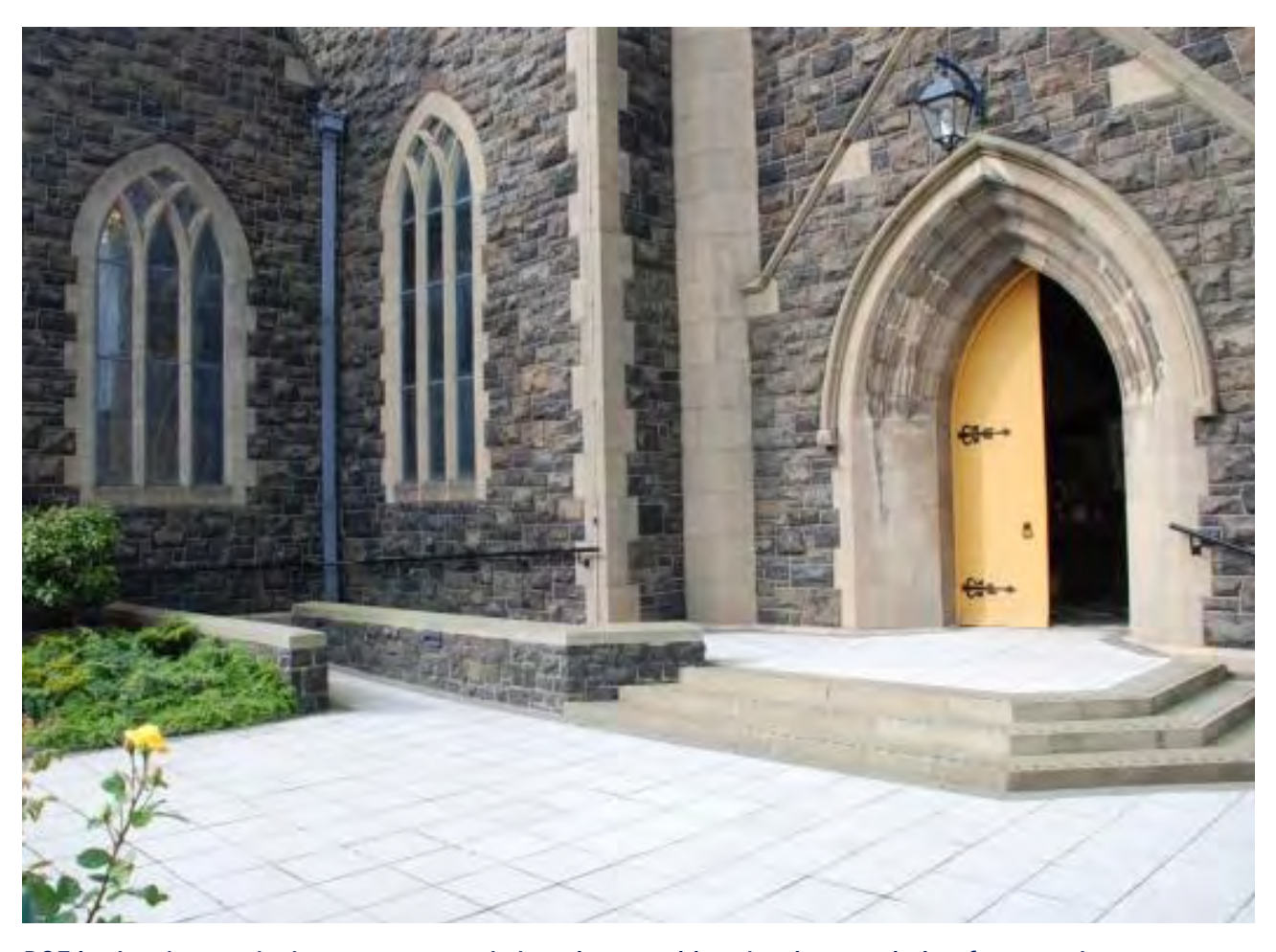
DOE is already consulted on some external alterations requiring planning permission, for example ramps

It has not been the Department's custom and practice to require listed places of worship to obtain planning permission for what may be regarded as minor works – for example, replacing windows or doors, removing render or changing the eaves detail. The cumulative impact of a series of minor changes can result in the loss of a listed building's special character, as seen in the places of worship delisted following the Second Survey. The Department will be issuing revised guidance to local council planning authorities advising that planning permission should be sought for all such works – which materially affect the external appearance of the building (Section 23(3)(a) Planning Act (NI) 2011).