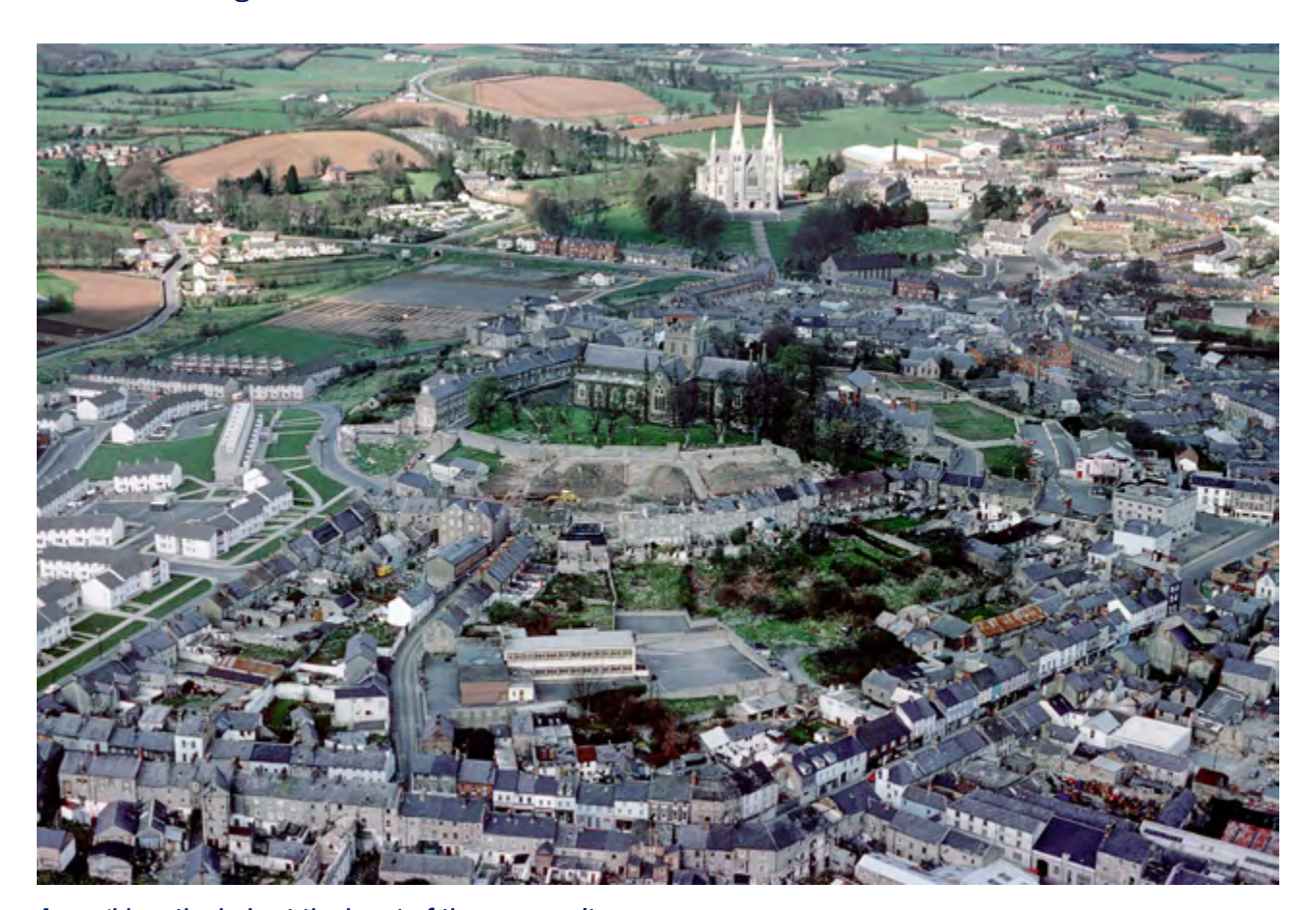
Armagh's cathedrals at the heart of the community

The consequence of removing the exemption is that Listed Building Consent would be required for any works involving the complete or partial demolition of a listed place of worship, or for its alteration or extension in a manner which would affect its character as a building of special architectural or historic interest - as is currently the case for all other types of listed building. HED would then participate in the process of assessing applications for Listed Building Consent as a statutory consultee to the new council planning authorities. It will also be able to offer pre-application advice to congregations to help them develop proposals, based on its experience and expertise in working with historic buildings.