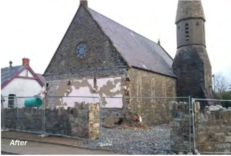
A listed Gothic Revival church and adjoining church hall. Under the Ecclesiastical Exemption, Listed Building Consent was not required for the demolition of the hall.