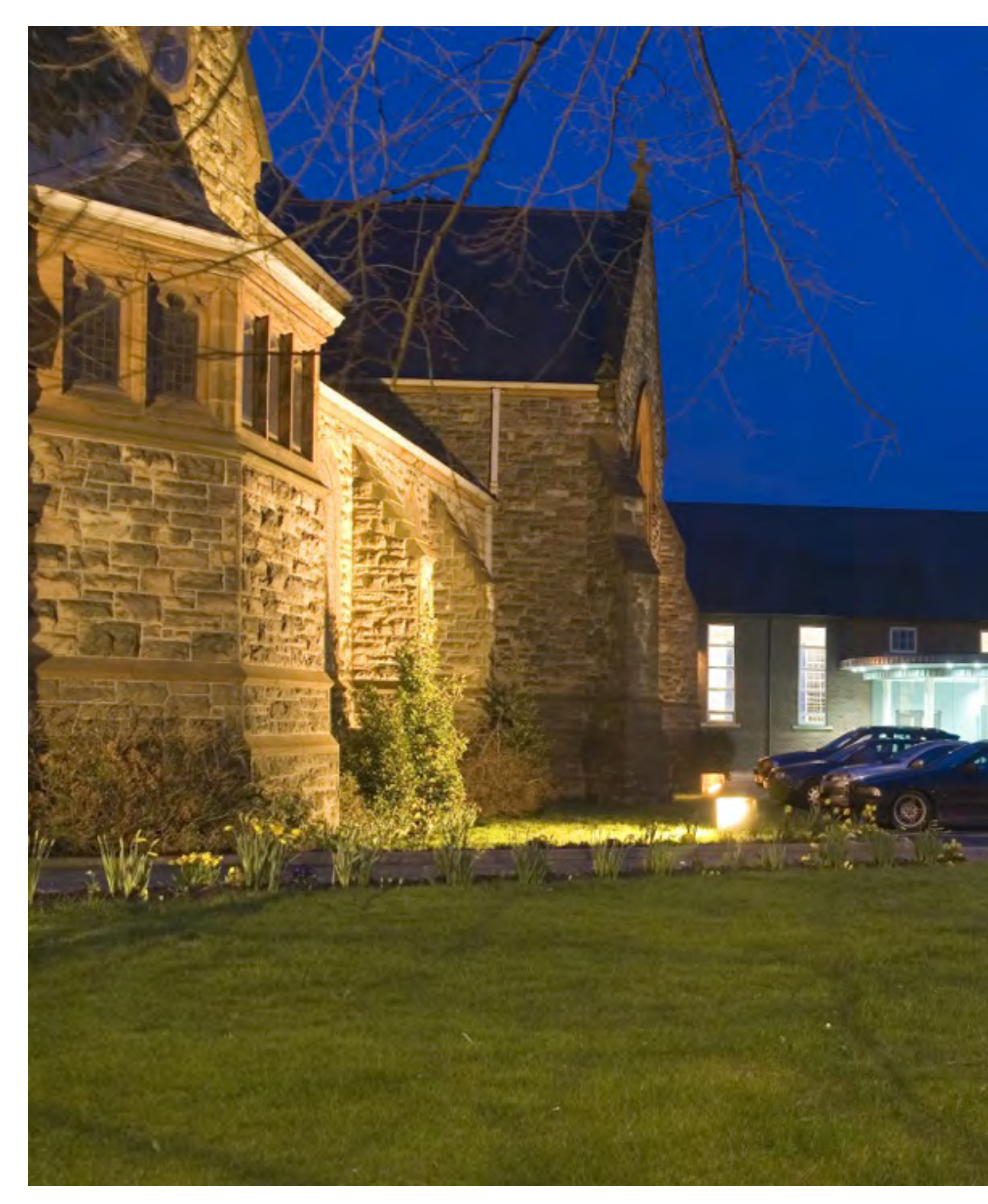
Well designed extensions can enhance a building's special character