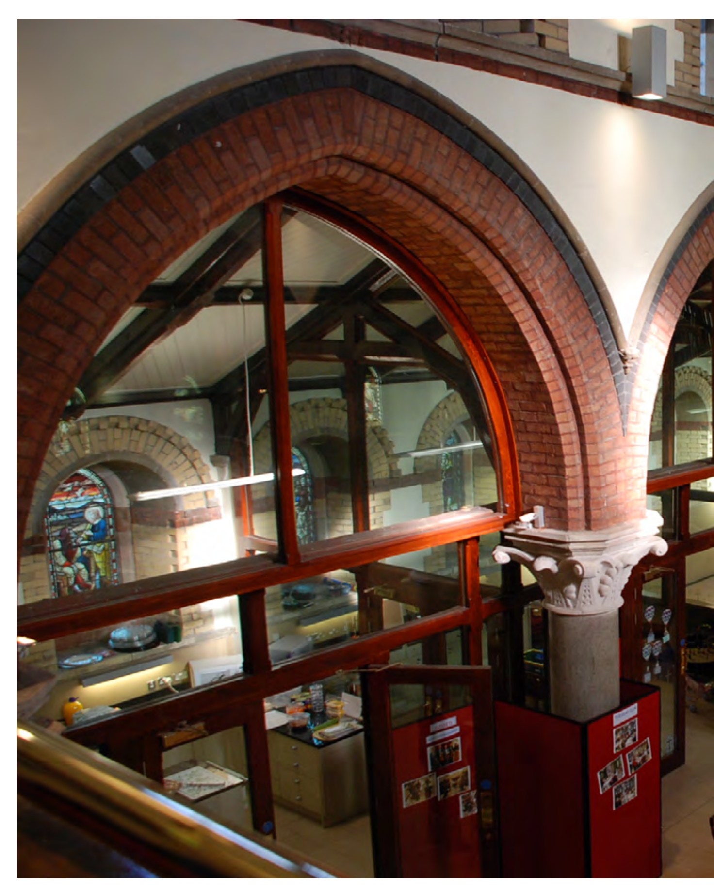
Working with congregations from the start of a project can result in high quality schemes which preserve the integrity of the building and allow new uses to flourish